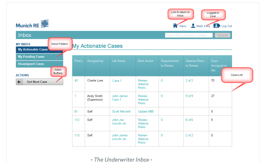
- The Underwriter Inbox -

The Case Details screen enables the user to navigate through risk and detailed evidence while having access to key underwriting data such as BMI and Smoker status available at all times.