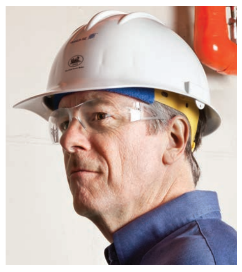
HSB's inspectors have a code of their own: When it comes to inspections, there's no room for shortcuts.

Helping to prevent loss was a founding principle in HSB's business and remains so today. In addition to jurisdictional inspections, we help our customers prevent loss with a variety of inspection services. These services include property inspections, electrical risk management surveys, loss prevention inspections, infrared electrical surveys, transformer oil analysis and equipment failure analysis. Our inspection services for equipment and property are designed to meet the needs of individual clients and the property-casualty insurance companies that partner with HSB.