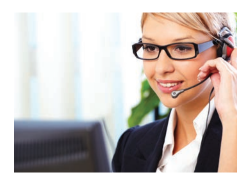
Wait for a customer to call? Not HSB. We keep track of code requirements and reach out to customers when it's time to inspect.

And we work to measure, assess and continually improve our process to maximize inspection completion.