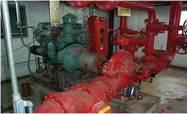
Annual full flow testing of a diesel driven firepump, as required by NFPA 25.