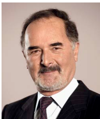
Dr. Bernd Pischetsrieder Chairman of the Supervisory Board