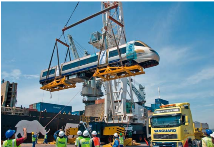
Moving forward: The first trains for the test runs are lowered onto the tracks.