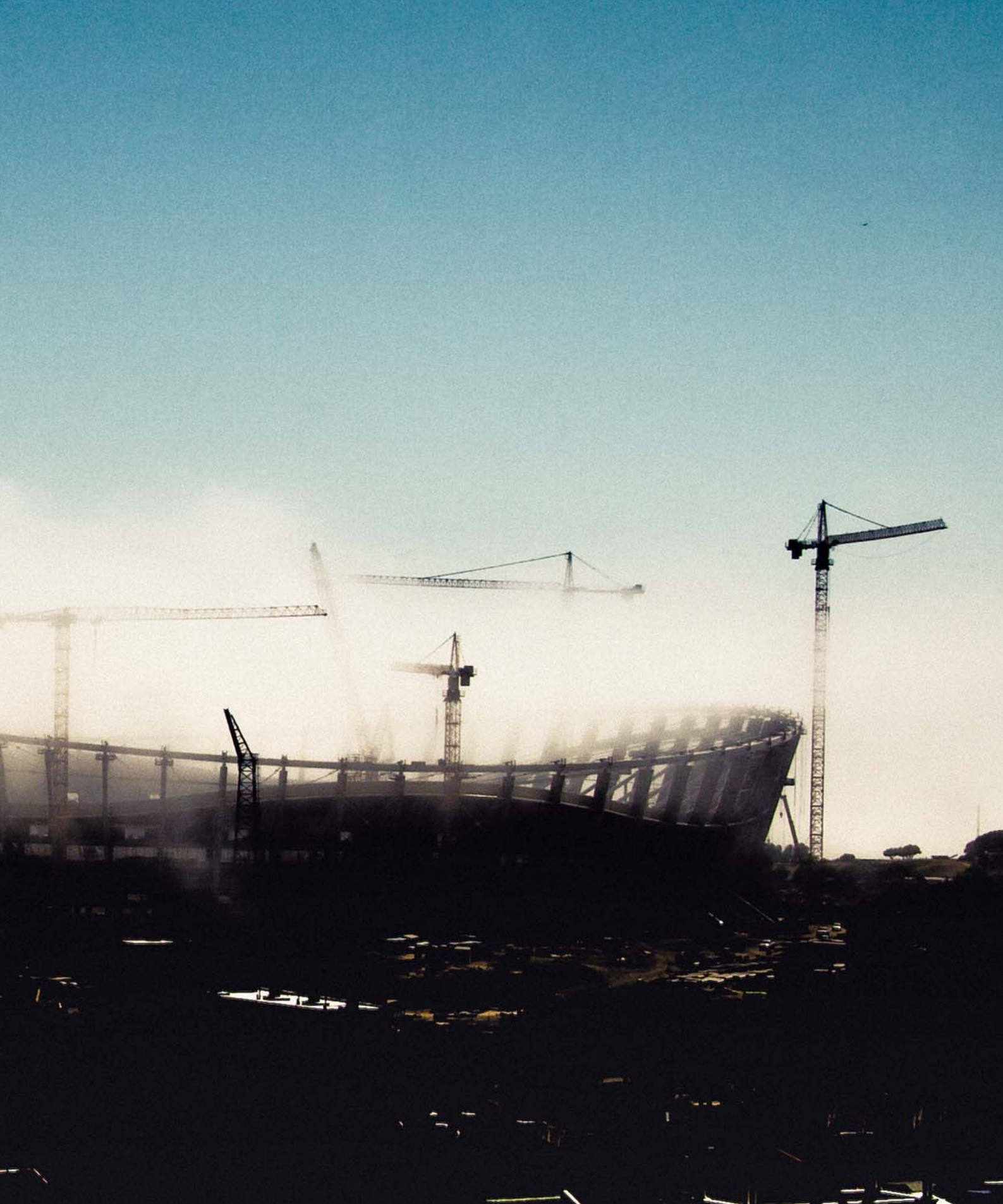
The Green Point stadium in Cape Town during construction.